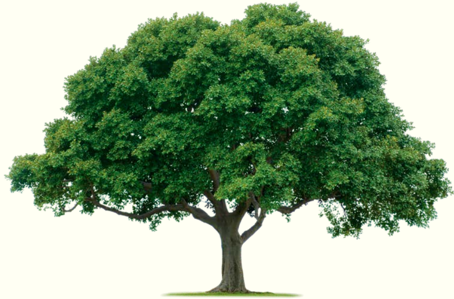
Tree of the Knowledge of Good and Evil