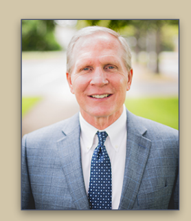
From My Window

Monthly e-Bulletin from Virginia Beach Theological Seminary